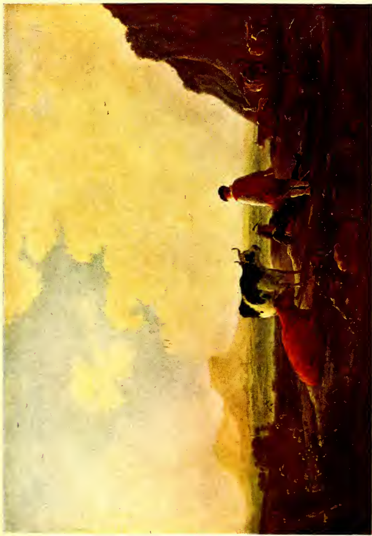
LANDSCAPE WITH CATTLE.

From the picture by Cuyp, in the Dulwich Gallery.